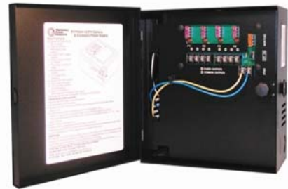
Model: CP424-4UL (4 Amp)