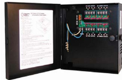
Model CP824-4UL (4 Amp)