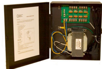
Model CP824-12 (12.5 Amp)