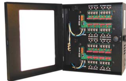
Model CP1624-8UL (8 Amp)