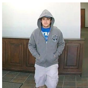
Height Strip Camera