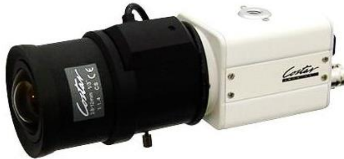
Lens not included

The CCC3100WD miniature box camera provides high quality video at 1000 TV lines of resolution. The Wide Dynamic Range (WDR) feature results in clear image quality in various lighting conditions. The low lighting technology ensures high resolution images in extremely bright backlighting conditions such as drive thru lanes or ATM machines. The compact size makes this camera the perfect choice for tight spaces or covert applications.