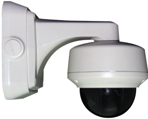
Shown with optional CDMKVFE Mount