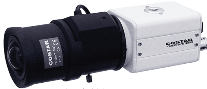
Lens not included